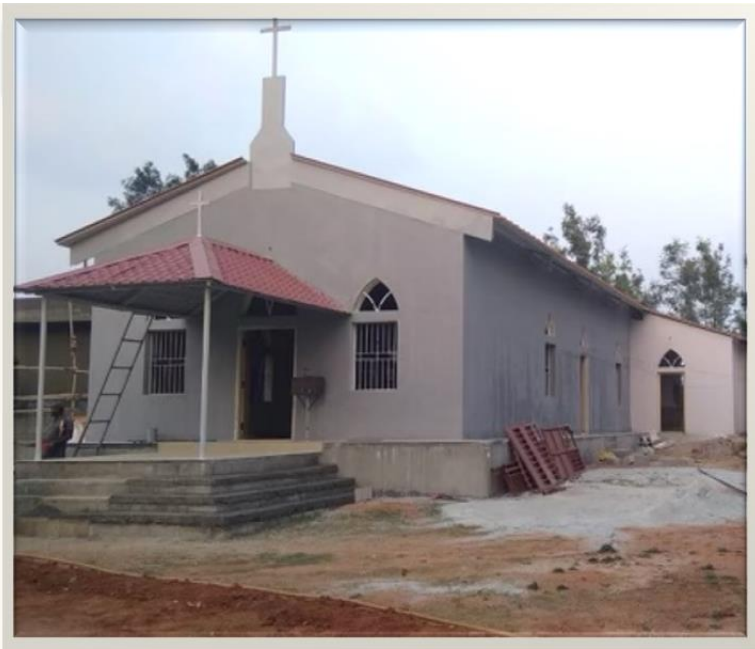
Trinity Edavaka Mission thanks all who supported the construction of a Mar Thoma Shivanapura Mission Chapel at Kalappanahalli village in Kanataka State